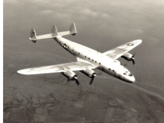
Lockheed Constellation (AKA "The SuperConnies")