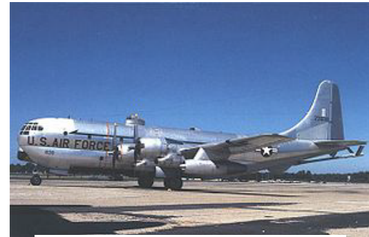
The KC97L Stratofreighter