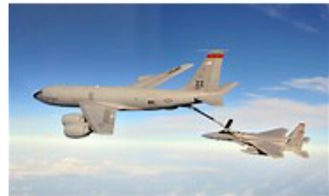
The KC 135 Stratotanker